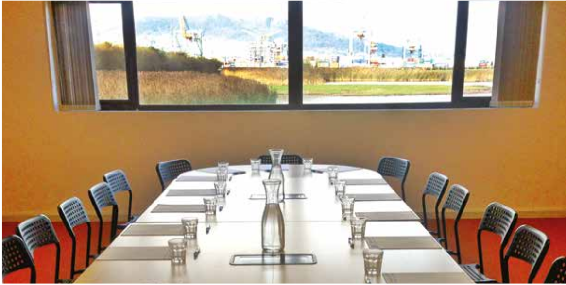
A bright and spacious room flooded with natural daylight.