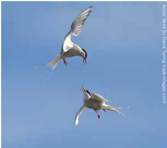
Arctic terns

Every year hundred of terns travel thousands of miles arriving at WOW in spring to breed and raise their young.